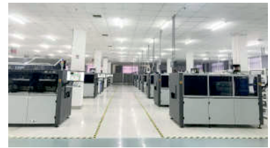
Selective Wave Soldering