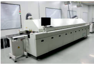
SMT Reflow Soldering

TF9 has a wide range of applications, including solder fume filtration, laser cutting plastic, laser soldering and laser marking etc.