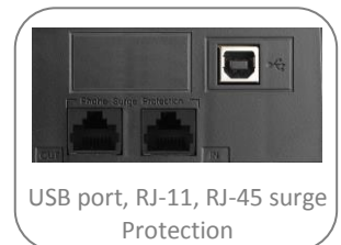
USB port, RJ-11, RJ-45 surge Protection