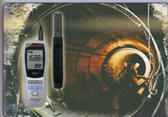
● Mining industry