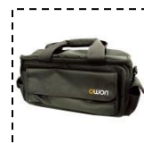
Soft Bag (optional)