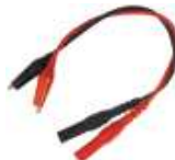
TH26004F Banana plugs - crocodile clip test leads