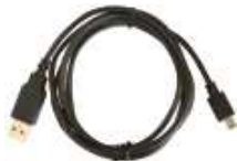
Mini-USB Communication Cable