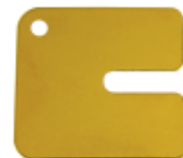
TH26010B Short plate