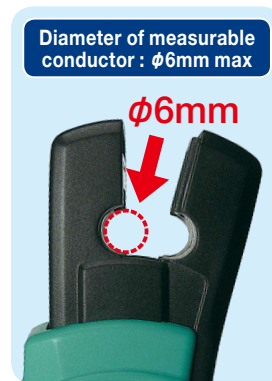
Diameter of measurable conductor : φ6mm max