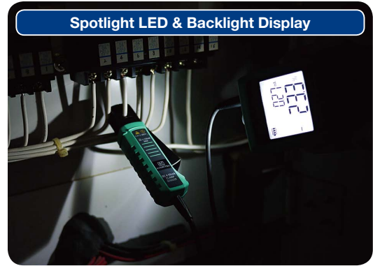
Spotlight LED & Backlight Display