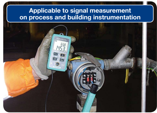
Applicable to signal measurement on process and building instrumentation