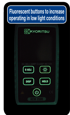
Fluorescent buttons to increase operating in low light conditions